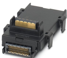
Axioline F bus base module for housing type F

Please be informed that the data shown in this PDF document is generated from our online catalog. Please find the complete data in the user documentation. Our general terms of use for downloads are valid.