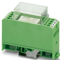
Relay module, with soldered-in miniature switching relay, contact (AgNi): medium to large loads, 1 changeover contact, input voltage 230 V AC/DC

Please be informed that the data shown in this PDF document is generated from our online catalog. Please find the complete data in the user documentation. Our general terms of use for downloads are valid.