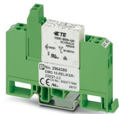
Relay module, with soldered-in miniature switching relay, contact (AgNi): medium to large loads, 1 changeover contact, input voltage 230 V AC/DC

Please be informed that the data shown in this PDF document is generated from our online catalog. Please find the complete data in the user documentation. Our general terms of use for downloads are valid.