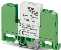
Relay module, with soldered-in miniature switching relay, contacts (AgNi): Medium to large loads, 1 N/O contact, input voltage 120 V AC/DC

Please be informed that the data shown in this PDF document is generated from our online catalog. Please find the complete data in the user documentation. Our general terms of use for downloads are valid.